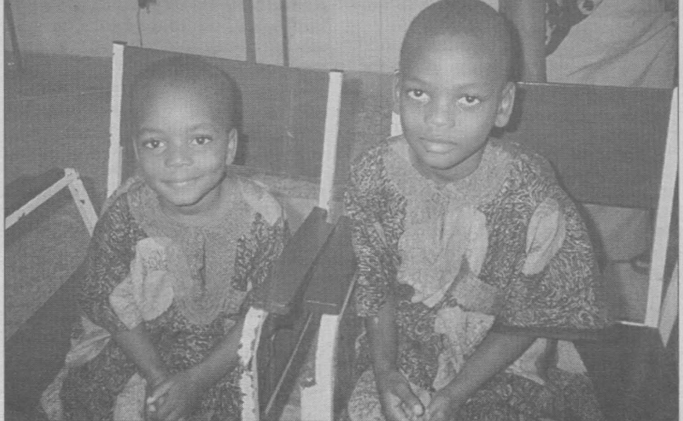
ONE FAMILY—Brothers at services in Cotonou.

We gave out the address of the church and telephone numbers of the principal men. Afterward, each of the men we introduced was surrounded by