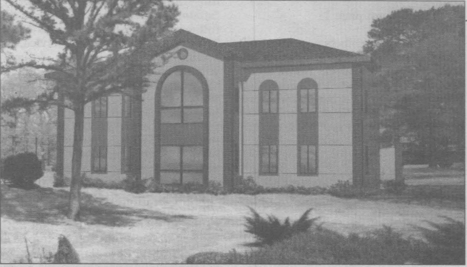
NEW RESIDENCE-A sketch of one of the proposed men's dormitories for the Ambassador College campus.

In addition, the college will offer a choice of selected AC merchandise to participants who sell a designated number of plaques. Those who sell at