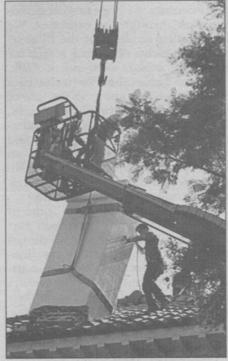
AMBASSADOR HALL—A quake-damaged chimney tilting 15 degrees was removed from roof.

chimneys on both buildings were damaged; chimneys less damaged will