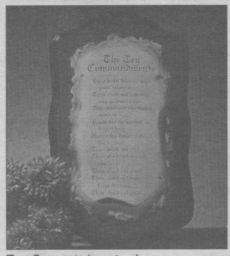
Ten Commandments plaque

Each residence, a spacious twostory structure housing 16 students,